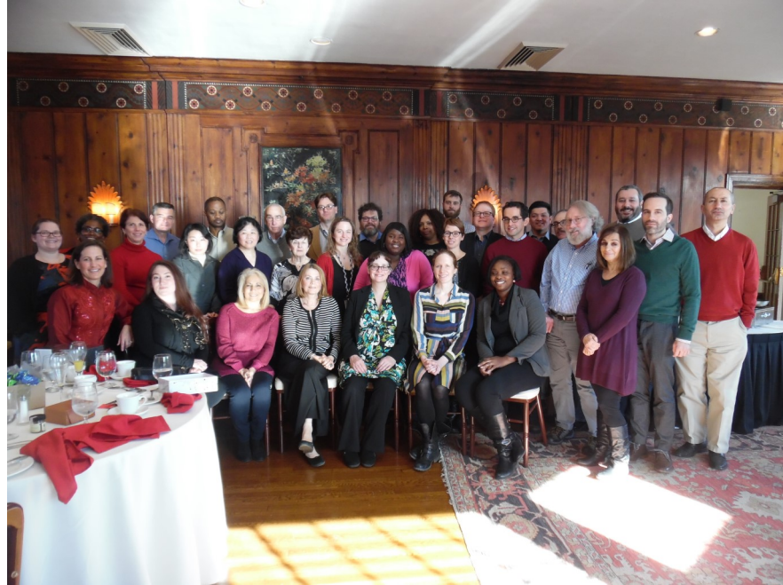
On behalf of the entire Law Library staff