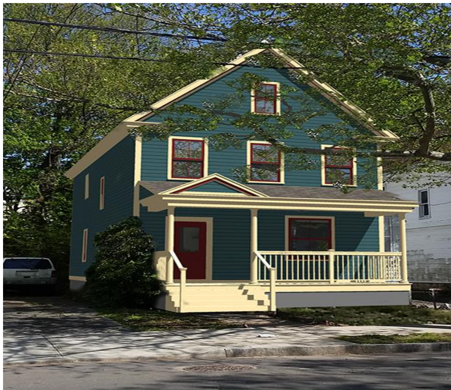
The final product of the Winchester Avenue project, as shown on NHS's website.

As both of these projects demonstrate, nonprofit development can be an expensive and complicated endeavor. One interviewee, Jim Farnham, expressed nostalgia for the old Urban Development Action Grants, which could be used as a single source of funding for an entire nonprofit housing project. 221 Given present political realities, though, most nonprofit developers are more focused on protecting their current subsidies than on re-imagining the status quo, as current programs face potential extinction under fiscally-strapped city, state, and federal governments. 222 More importantly, these projects show that nonprofits often come up with creative and multi-faceted ways to finance their projects, and that inefficient government processes do not stop nonprofit developers from breaking ground on new projects.