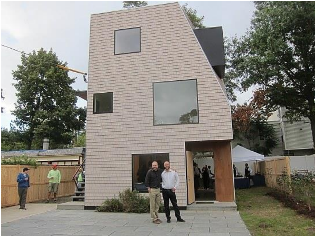
Nonprofits being innovative: a “tiny house” built by New Horizons and the Yale School of Architecture in the West River neighborhood.