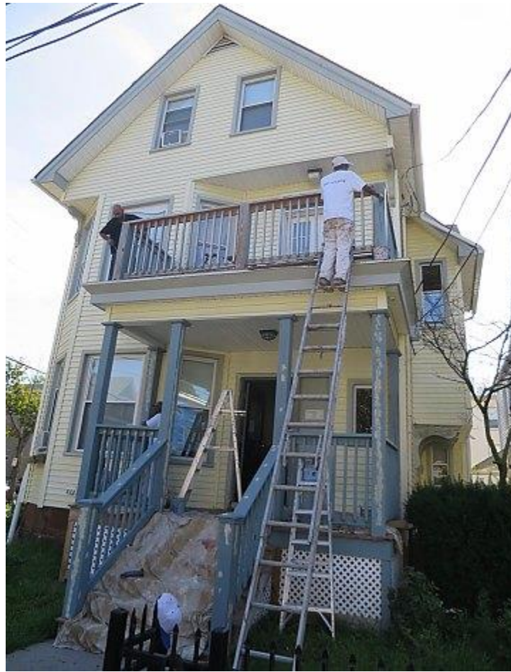
The Community Builders and the City of New Haven worked in tandem during the summer of 2016 to repair the oft-maligned Kensington Square apartments in the Dwight neighborhood.

to improve Kensington Square. 143 Yet, perhaps because of this experience with TCB, New Haven has tended to work with large for-profit developers on its most significant affordable housing projects, e.g. , McCormack Baron Salazar, as opposed to Housing Partnership Network nonprofits. 144