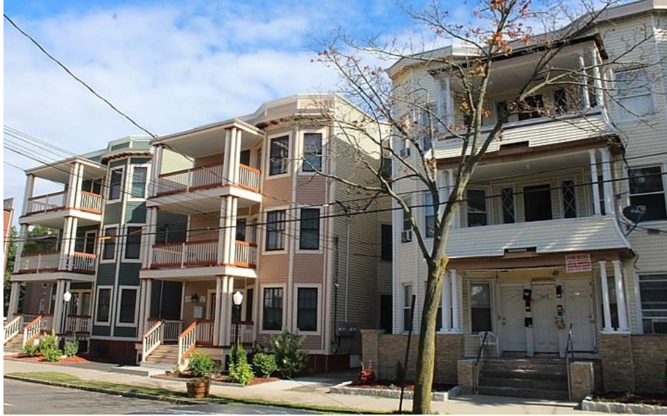
NHS-rehabbed houses in the Dwight neighborhood (the two multi-family complexes on the left).

New Horizons, by contrast, acts like both a CDC and a regional developer. While the group does substantial block-focused community homeownership in Fair Haven – New Haven’s largest Hispanic neighborhood – it also builds large rental housing developments in nearby suburbs. According to the organization’s most recent annual report, New Horizons built 113 new and rehabbed housing units in 2015 alone, making it far and away New Haven’s most productive nonprofit developer. 125 The annual report also indicated that New Horizons currently has 37 employees, manages 573 units, and holds assets worth $85 million (NHS, by contrast, has 25 employees and holds assets worth around $6 million, though it does not own the houses it builds). 126 New Horizons also participates in cutting edge affordable housing projects, like a