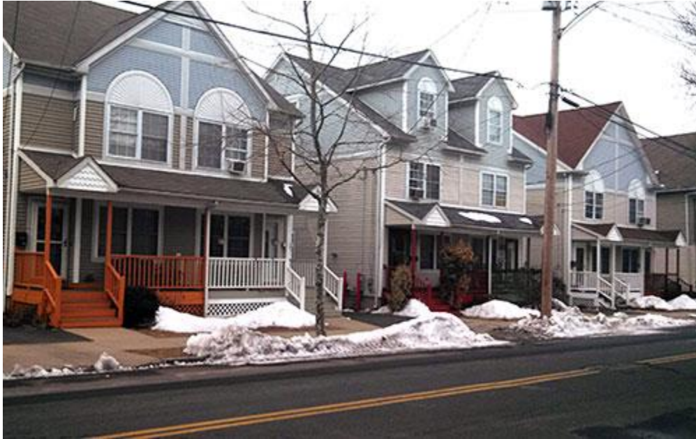
Three single-family homes developed by Beulah Land Development Corporation on Orchard Street, in the Dixwell neighborhood.