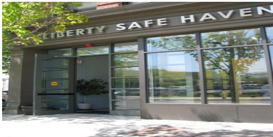
The exterior of the Safe Haven project on State Street, in downtown New Haven.