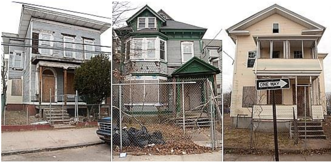
Three uncompleted Hill Development Corporation projects. These units were later bought and refurbished by the City of New Haven.

at an inefficient scale; we took an idea from New York City and tried to implement it without regard to New Haven's size." 106 Jorge Perez, the former New Haven alderman and current state Banking Commissioner, put it less charitably, saying Fernandez and DeStefano "killed" the CDCs, before then negatively comparing their efforts to the more community-centric Mayor Biago DiLieto (DiLieto was New Haven's mayor from 1979 to 1989). 107 It is unclear how many housing units the neighborhood-based CDCs produced during their time in New Haven.