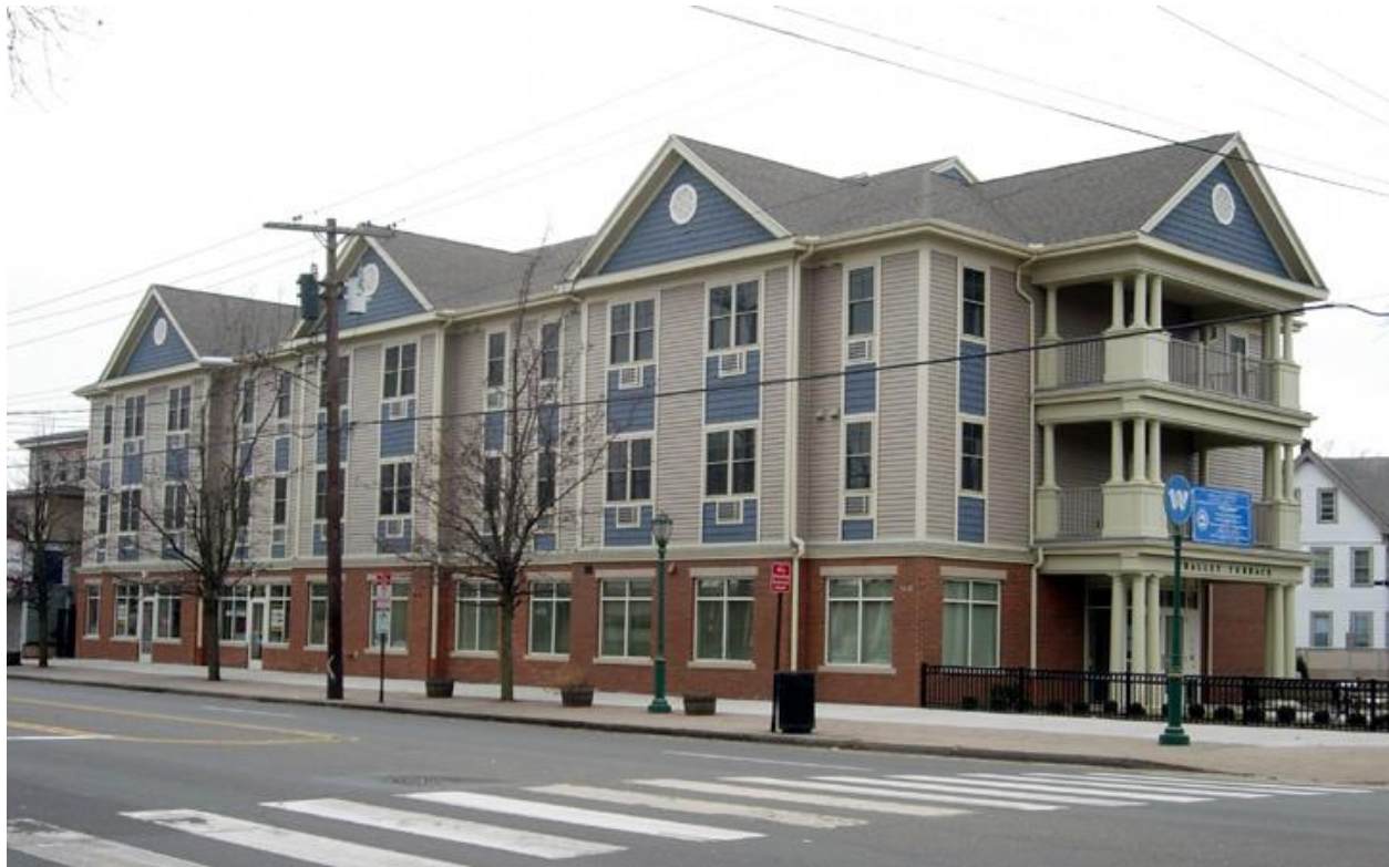
Columbus House's Whalley Terrace project.

stay there instead of on the streets.” 150 As such, almost everyone I interviewed agreed that supportive housing showed the necessity of nonprofit participation in the housing market. 151