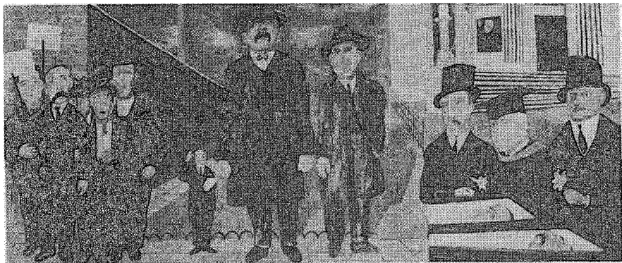
Figure 1. The Passion of Sacco and Vanzetti , Ben Shahn, 1931-1932.

Consider, for example, Ben Shahn's Passion of Sacco and Vanzetti , a work with many incarnations, the most elaborate of which is a mural at the University of Syracuse. 17 (Needless to say, none can be found in a courthouse.) Here, Judge Lowell is barely visible, looking out through a window in his courthouse as if from the prison of the law. The defendants, Sacco and Vanzetti, loom large front and center. In some versions, they are in their caskets. Demonstrating members of the public stand to the left, and on the right are Harvard's President Lowell and the other members of the commission that upheld the conviction. So justice—or rather injustice—is presented as a public and political struggle that