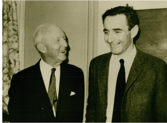
Justice Hugo L. Black and Charles Reich February 27, 1966