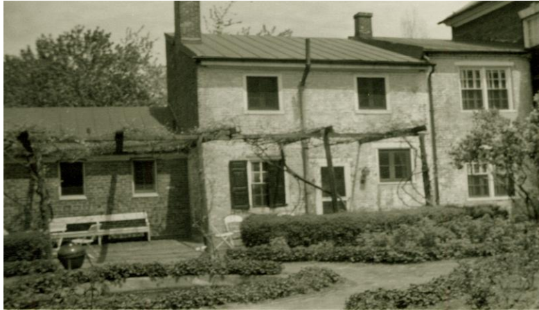
Backyard view of 619 South Lee Street in October of 1956. (Center) clerk apartment & grape arbor. (Left) The bench where Justice Black discussed Brown v. Board of Education. (Right) The main house.