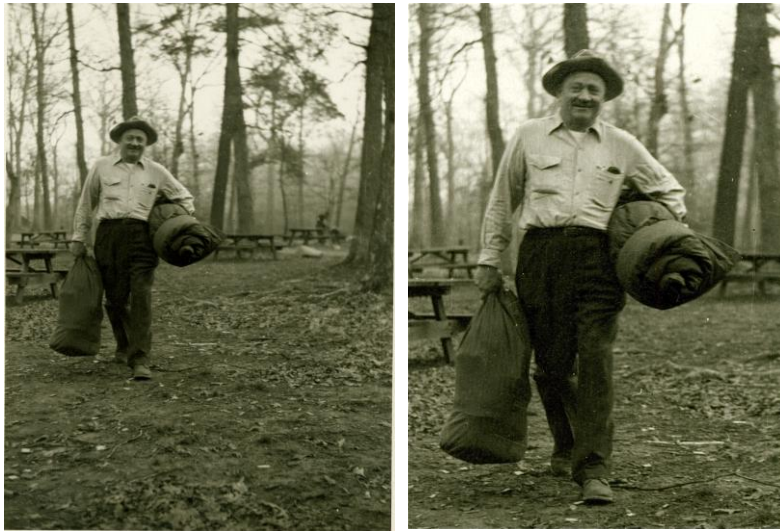
Justice Douglas after an overnight trip on the C&O Towpath in May 1956—one of the few photos of the Justice smiling.