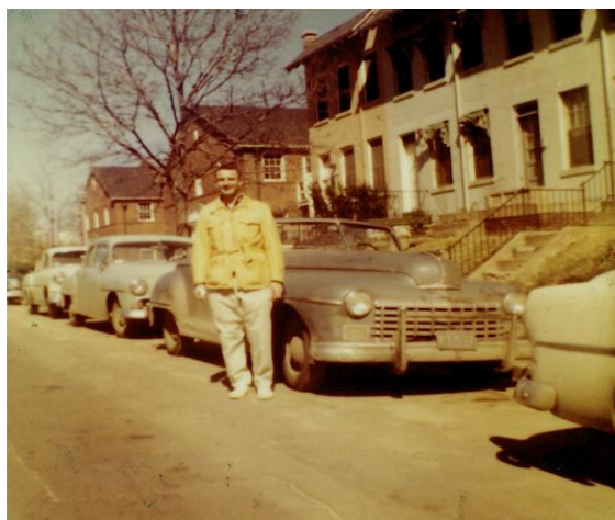
Charles Reich next to his blue Dodge

Rosenberg case. He reluctantly agreed to listen. Even more reluctantly, he concluded that their argument—that the Rosenbergs had been convicted and sentenced under the wrong statute—required a full hearing. 47 Accordingly he issued a stay of execution until the Court's fall session, 48 jumped into his car, and started the long drive to his summer cabin at Goose Prairie, Washington. When he stopped for the night at a motel on the Pennsylvania Turnpike, he turned on the television news and was stunned to learn that Chief Justice Vinson had called a special session of the Court to overturn the stay. 49 The next morning he headed back to the hearing, which both he and Justice Black believed was improperly called.