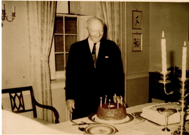
Justice Black at the dinner table next to his chair February 27, 1966